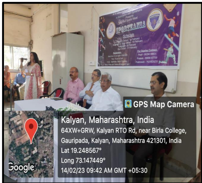
Inauguration of Sportzania - 2023