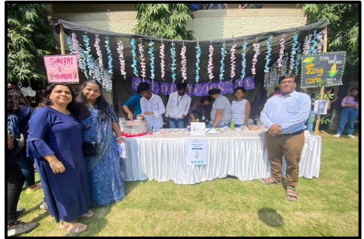
Stress relieving activity with Mpower Cell