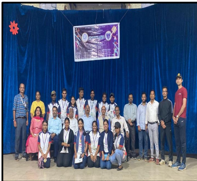
Valedictory function of Sportzania