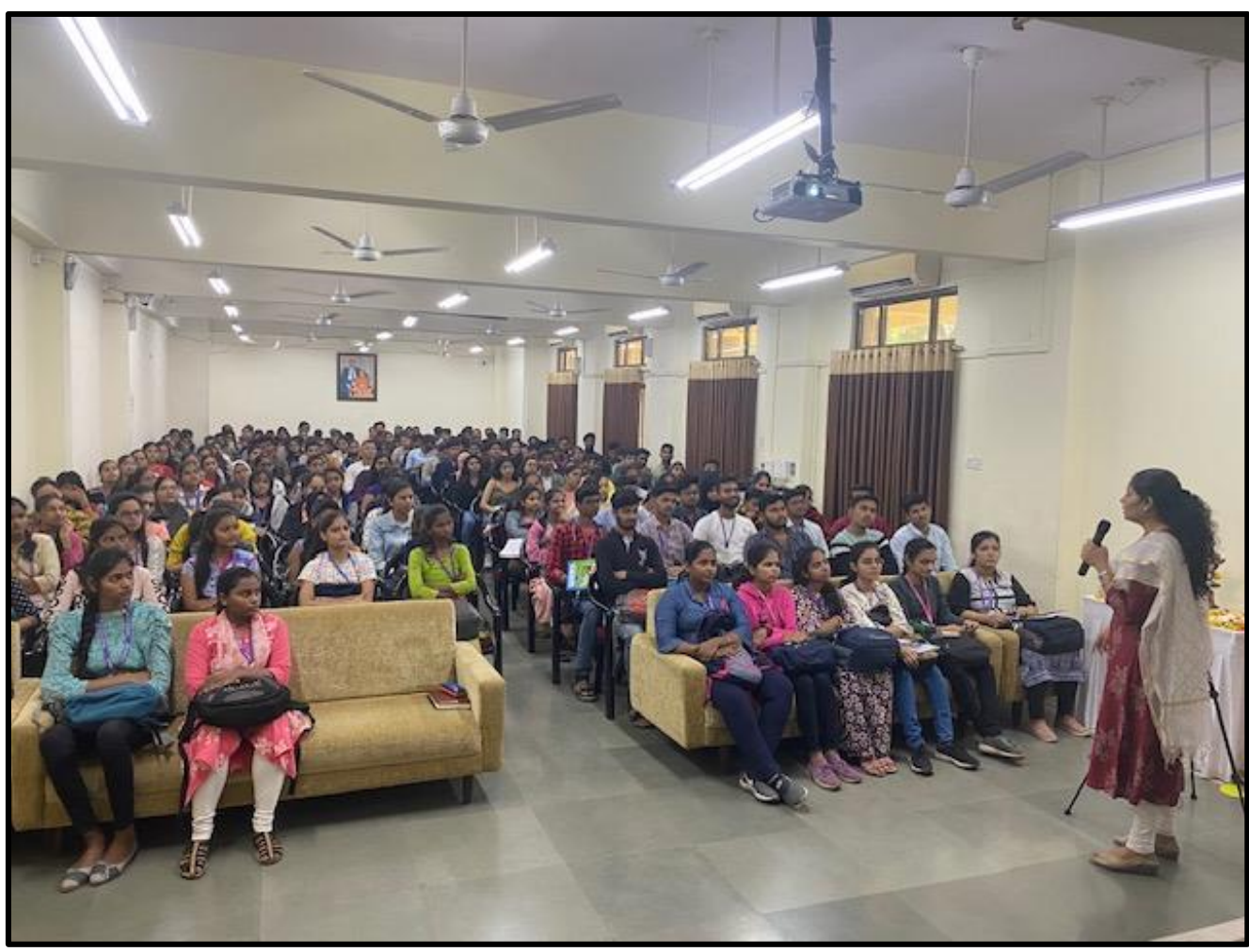
Two days workshop on Interview and Resume writing Skills