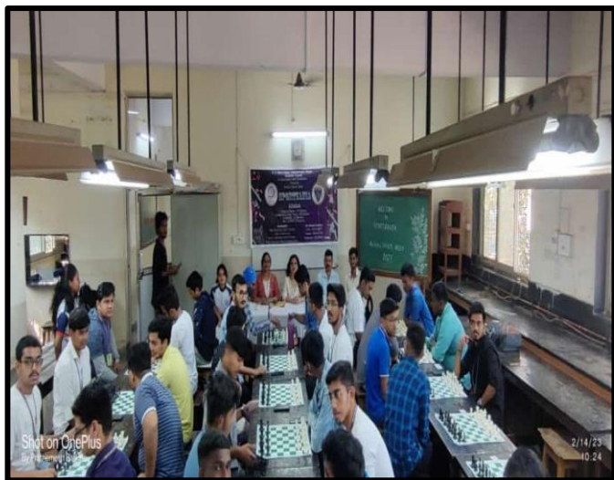
Inter Class Chess Competition