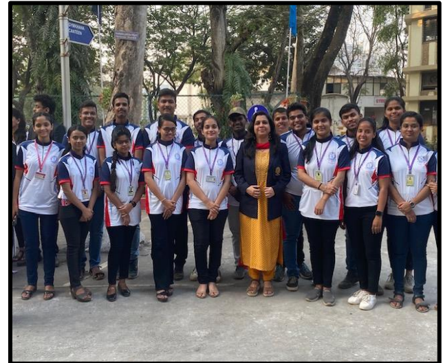
Students' Council troupe during Convocation Ceremony