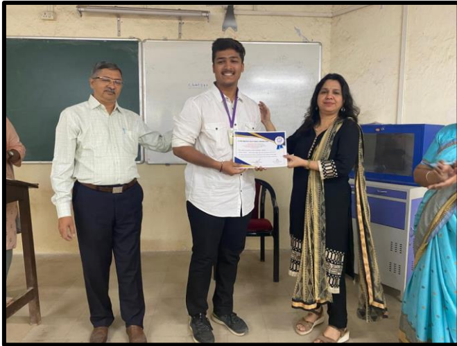
Appreciation certificates distributed to Students' Council Members