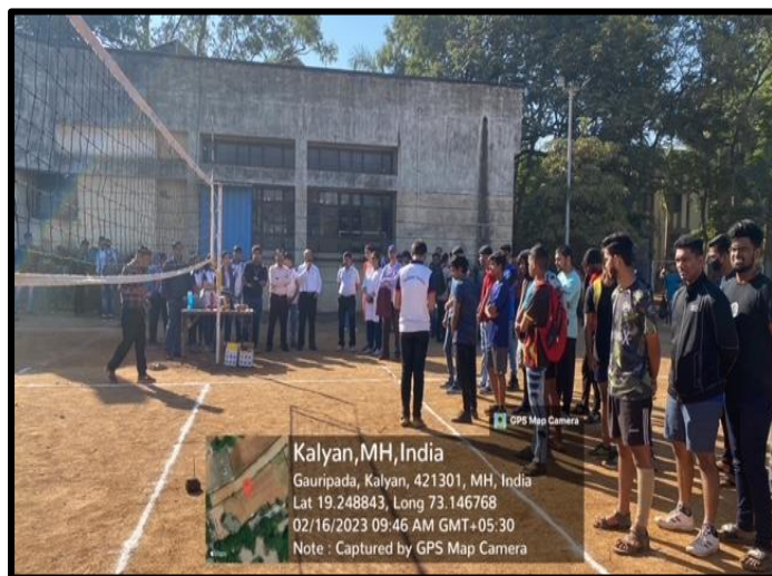
Inauguration of Outdoor games

Principal B. K. Birla College of Arts, Science & Commerce (Autonomous), Kalyan.